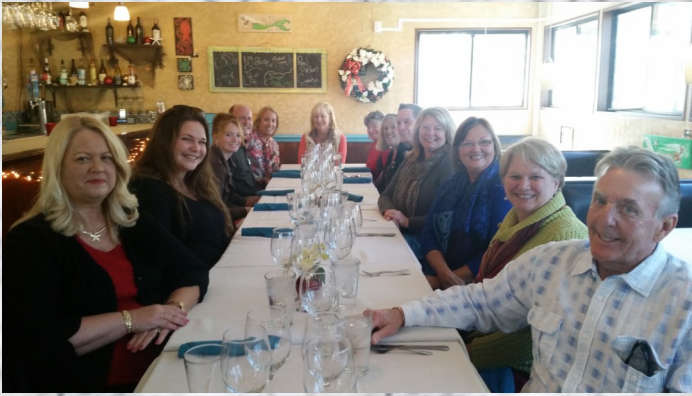
Over the holidays, Century 21 Nachman Kitty Hawk office donated over 150 pounds of food to the local food pantry for distribution to needy families.